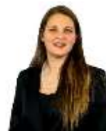
Katie Dugas-Truss Legacy YMCA