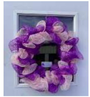
Chamber Member Second Storage Attic

Throughout the month of October, the chamber encouraged local businesses and organizations to join in and support Breast Cancer and Domestic Violence Awareness by “painting the city of Bessemer pink and purple”; pink and purple bows were displayed around the chamber, city hall, and other businesses in the downtown area in preparation for the 7 th Annual Pink & Purple Parade! The Pink & Purple Parade was hosted by the Bessemer Business Professional Women’s Organization, in partnership with the Bessemer Area Chamber of Commerce and the City of Bessemer, on Monday, October 17 th at DeBardeleben Park in downtown Bessemer! Several vendors were set up in the park, as guests enjoyed food prepared by the Bessemer Elks Lodge 721 and received free giveaways from the Bessemer Fire Department (BFD). The parade began at 5:15pm, and festivities continued in the park until 7pm.