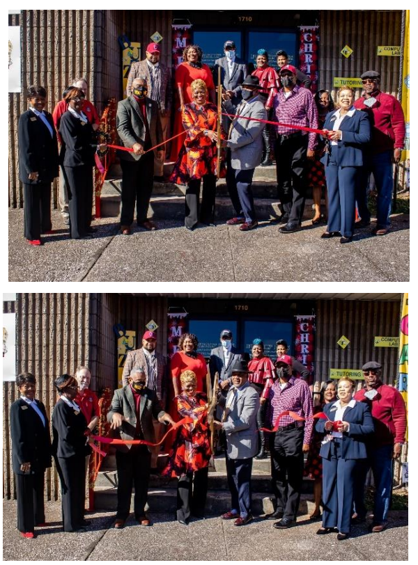
Buzzin' Bees Learning Center's ribbon cutting was held on Thursday, December 23, 2021. They are located at 1710 Second Avenue N, Bessemer, Alabama.