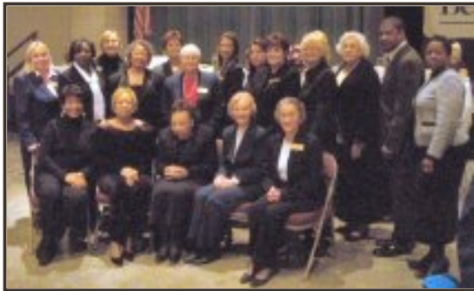
Ambassadors pose during annual banquet