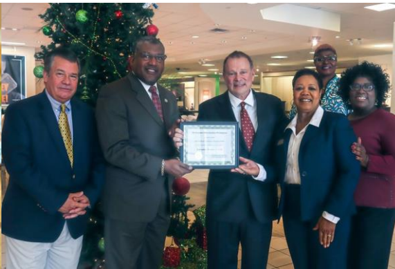
OFR Furniture Return Store , located at 4835 Promenade Pkwy, Bessemer, AL 35022