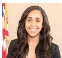
Tabitha Dudley Legacy YMCA