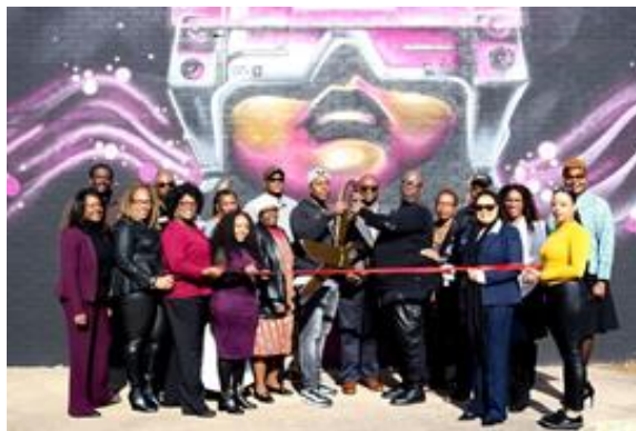
Plush Bar and Grill , located at 4000 Bessemer Super Hwy, Bessemer, AL 35020