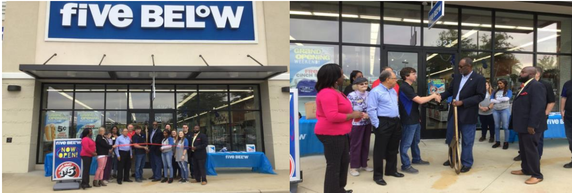
Five Below , located at 4921 Promenade Pkwy, Bessemer, AL 35022.