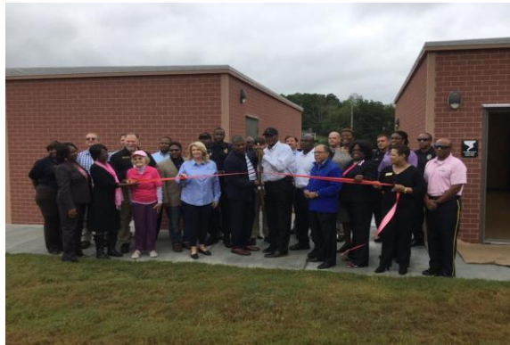
Public Safety & Community Saferooms , located 651 Ninth Avenue SW, Bessemer, AL 35020.