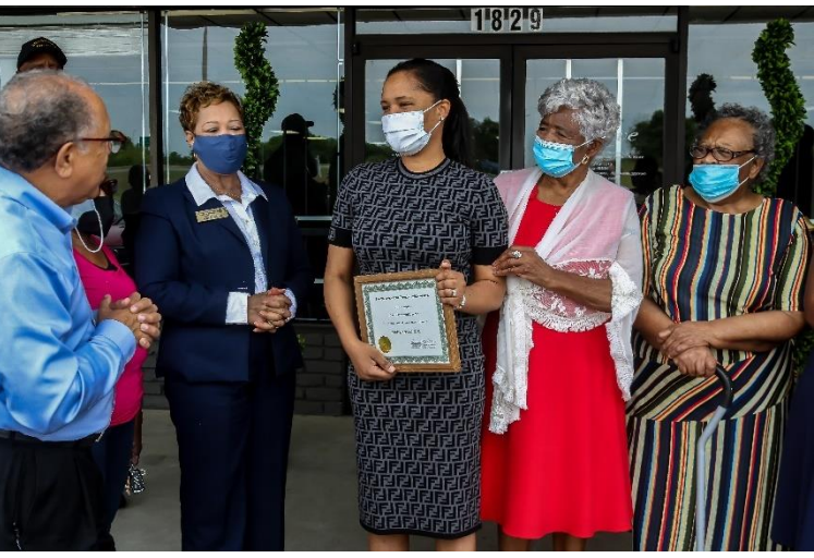
After Five Event Center's ribbon cutting was held on April 30<sup>th</sup>, 2021. After Five Event Center is located at 1829 13th Avenue North, Bessemer.