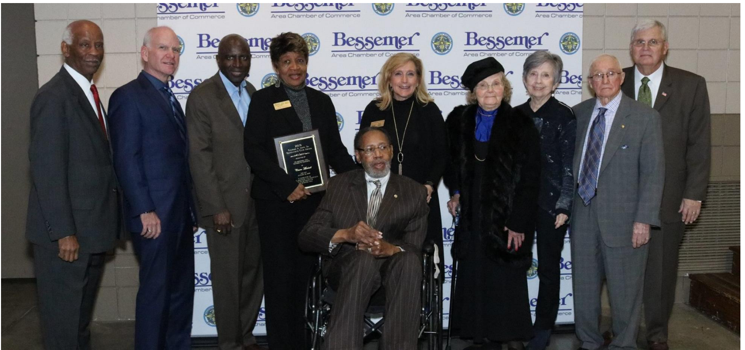
From Left fo Right