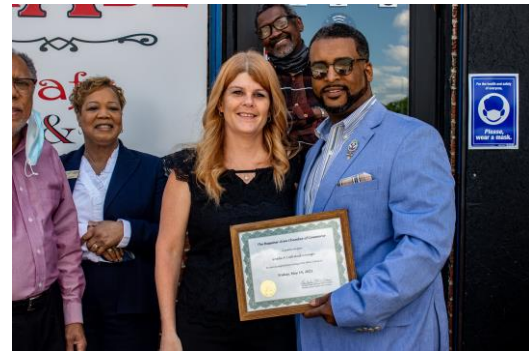
Grade "A" Café and Lounge's ribbon cutting was held on May 14 th , 2021. Grade "A" Café and Lounge is located at 830 22nd Street North, Bessemer, AL.