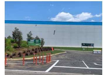
The new Amazon Delivery Station being constructed off Lakeshore Parkway.