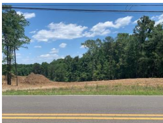
A new Habitat for Humanity subdivision will be constructed off Hopewell Road.