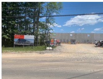
Construction continues on the new Lowe's Distribution Center off Morgan Road