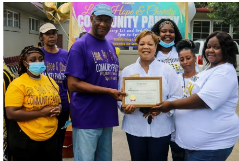
Chamber Member Nurturing Golden Hearts' ribbon cutting for their community pantry was held on Thursday, June 17, 2021. Nurturing Golden Hearts is located at 1404 26th Street North, Bessemer, Alabama.