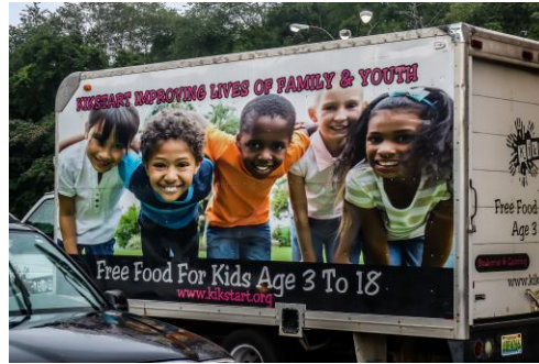
Kikstart's ribbon cutting was held on Thursday, June 11, 2021. Kikstart is located at 518 West Towne Plaza, Bessemer, Alabama.