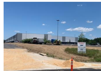
The new FedEx facility being constructed off Rodeo Court just off Lakeshore Parkway. Portions of the facility will be in both Birmingham and Bessemer thanks to a partnership between our two cities.