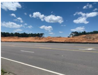
Site prep for the Church of the Highlands’ new Bessemer campus off Academy Drive.

Message from the City of Bessemer: “There is a lot of dirt being moved in Bessemer these days if you haven’t noticed. Our city is really starting to bloom. We thank all of the new companies and investors in our city, whether they be homebuilders or those who are creating new jobs to spur Bessemer’s economy.”