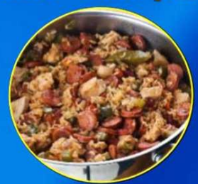
Chicken & Sausage Jambalaya