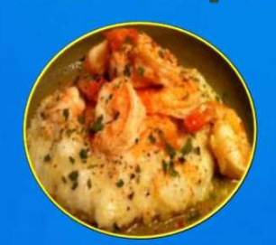
Shrimp & Grits

ONLY TASTE OF BESSEMER TICKET HOLDERS ARE ALLOWED TO ATTEND