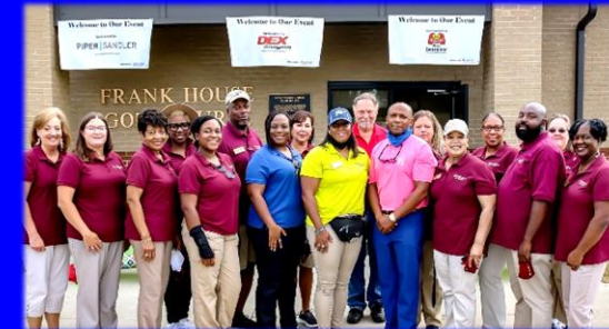
2020 Photos Above

Bessemer Area Chamber of Commerce 321 18th St. N., Bessemer, AL 35020 mmilan1@bellsouth.net