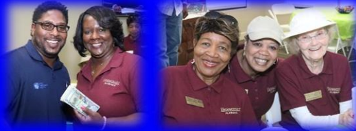
2019 Photos Above